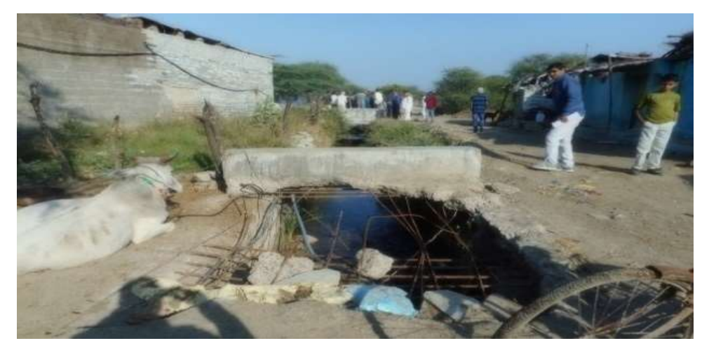
LMC Piplad Project near Amli Kurd village

(i) In Piplad, Mamtori and Ghat Pick Up Weir, canals were in damaged position at some places. In Mamtori, the broken portion was being used as a path.