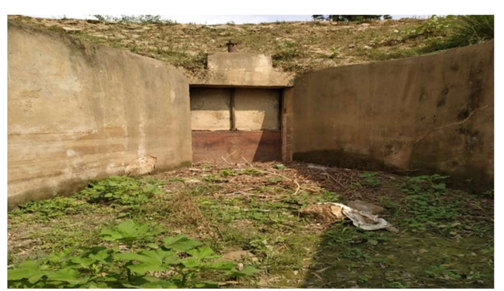
Head sluice at Ghat Pick Up Weir