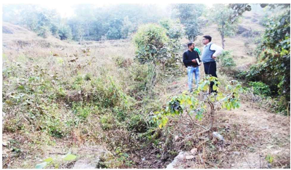
Vegetation/silting in the Do Nadi canal

(iii) In Do Nadi, it was seen during physical verification that there were seepages in dam and accumulation of silt and vegetation in some reaches of canal, causing loss of water flow.