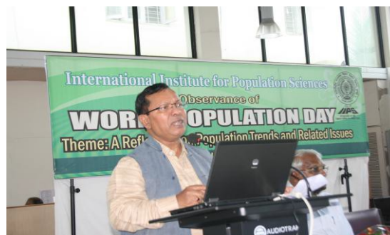
Director delivering talk on World Population Day