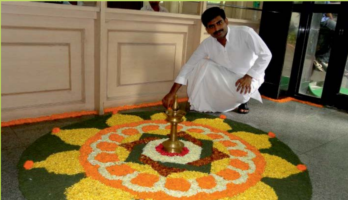
Onam celebration at IIPS, 2012