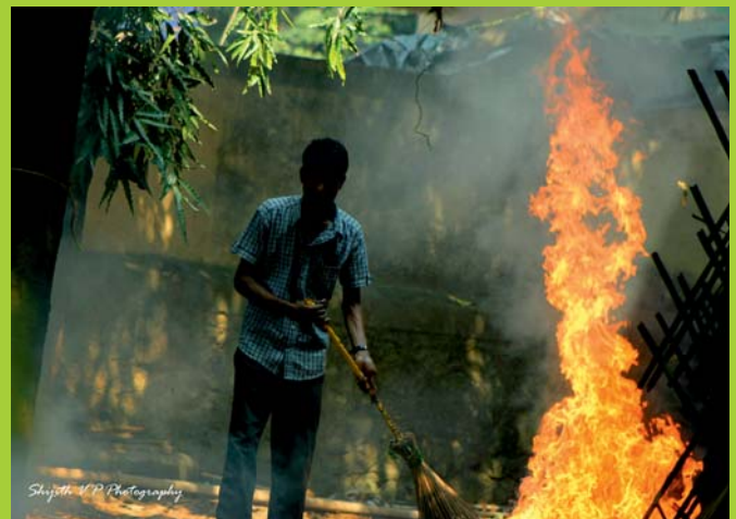
Students Cleaning the surrounding: a drive against Dengue

According to data compiled by the state's health department, areas falling within Greater Mumbai registered 504 cases of dengue — the highest in the state — till September 2012. With this alarming rise in the dengue cases, an initiative was taken by IIPS students to clean the campus and the surroundings as a precautionary measure to prevent the breeding of the mosquitoes and thus looking after each other's health.