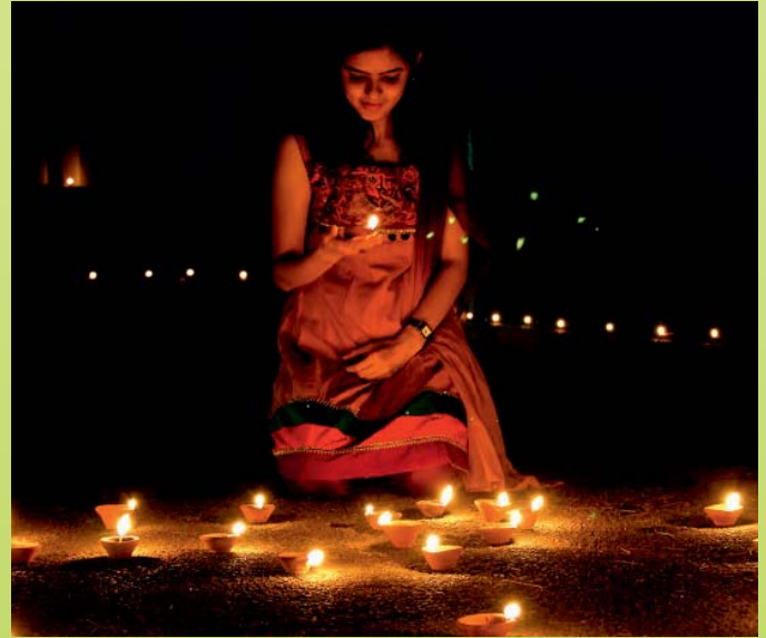
Diwali Celebration at IIPS, 2012