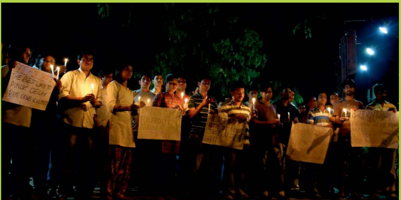
IIPS Students protesting against Rape Case of New Delhi, 2012-13