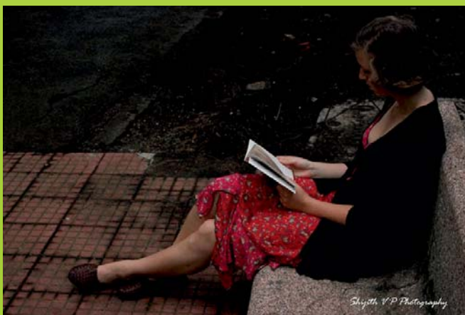
Foreign student reading in front of New Hostel, IIPS, 2012

I would like to take an opportunity through this news letter to congratulate the IIPSAA founders to give us a platform where all students can share their opinion and contribute more and more to the demographic fraternity. I would like to see my friends of IIPS performing well in activities beyond academics too. Other alumni associations like Management and Medical institutes perform well in all spheres, as they show interest in a variety of events.