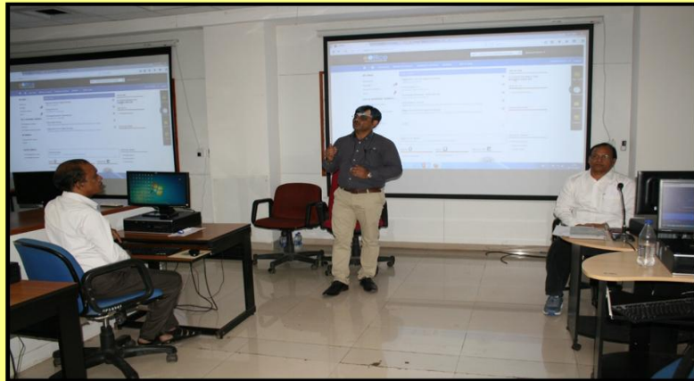
Training session in data center organised by ICT unit

The purpose of the training was to familiarise the IIPS users with various modules of e-Office application so that they can use the applications most effectively.