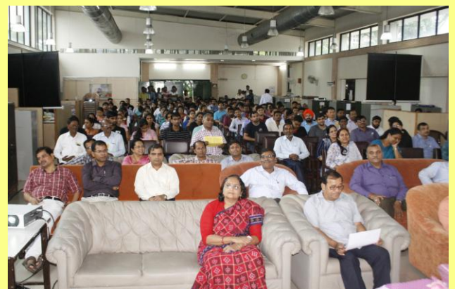
Audience on World Population Day