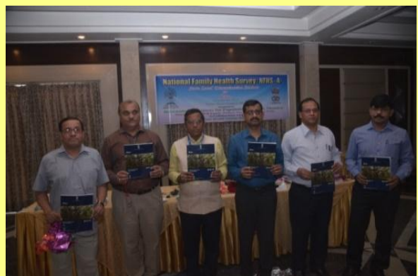
Releasing of Bihar state report on day of dissemination, Patna, 4 Oct., 2017