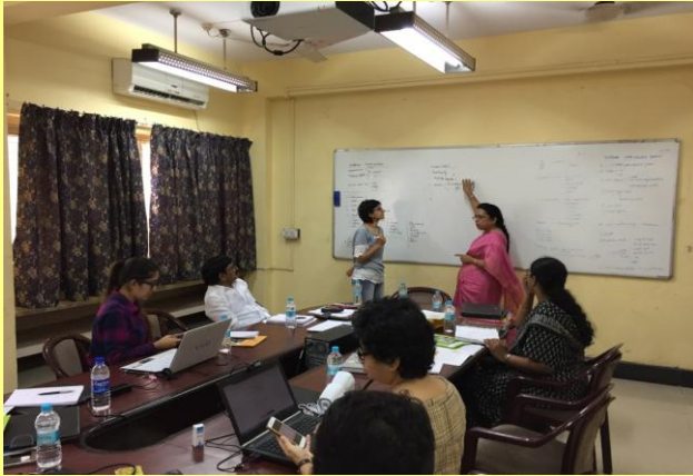
Interactive session during the workshop, 7-8 September, 2017