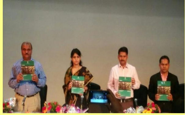
Releasing of Odisha state Report on the day of dissemination, Bhubaneswar, 17 Oct., 2017