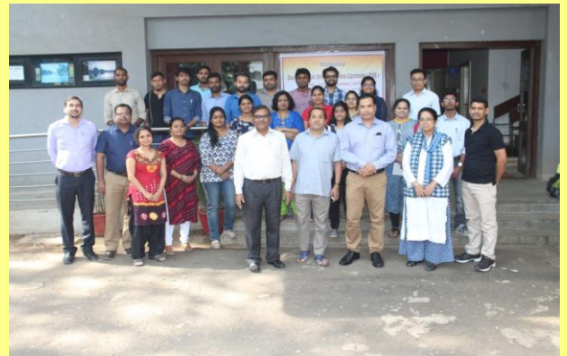
Participants of GIS workshop