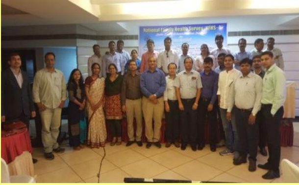
NFHS-4 coordinators and participants of Uttar Pradesh state dissemination, Lucknow, 6 Oct., 2017