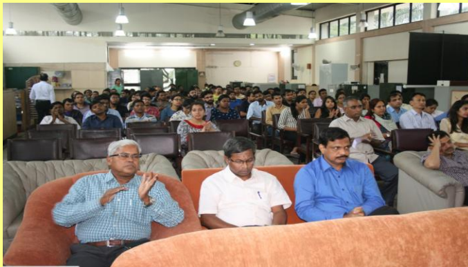
Audience on the day