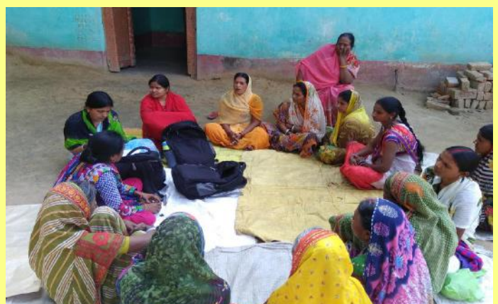
FGD with left behind women in a village of Bihar

The Dept. of Migration and Urban Studies, with an objective to develop a comprehensive understanding about migration phenomenon and lives of the people living in migrant sending villages from Middle Ganga Plain, has been working on a institute-sponsored project entitled, "Causes and Consequences of Out-Migration from Middle Ganga Plain" since 2016. First phase of field work has been completed with collection of data from more than 2250 households spread across 36 villages and 17 districts in Bihar in July 2018. The training was organized in AN Sinha Institute of Social Studies, Patna. Data was collected in CAPI for which software has been developed in house. Training of Investigators and fieldwork of Second Phase in eastern UP is scheduled from February 2019. The coordinators of project are: Dr. Archana K Roy, Prof R.B Bhagat, Prof K.C Das, Mr. Sunil Sarode and Dr. R.S. Reshmi.