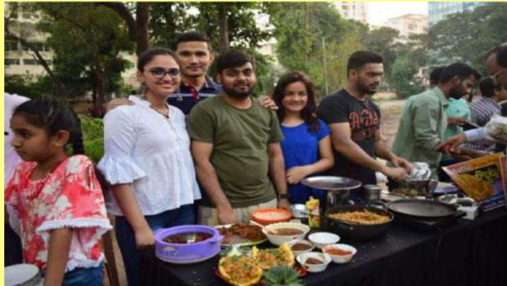
Participants with their delicacies at the Food Fest “LAZEEZ”

Diwali , the festival of lights, was celebrated with great joy by students and staff. There were around 1500 Diyas lit all around the campus which created a mesmerizing view of the institute. “ Lazeez ”, the very new initiative by the cultural committee was celebrated on 21 st December, 2018. The whole college seemed enthusiastic as they served exotic homemade delicacies. Students participated in large numbers and many students also took interest in specific dress codes.