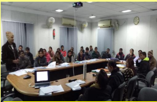
ToI at AN Sinha Institute of Social Studies, Patna

Middle Ganga Plain situated in between foothills of Himalaya from north and peninsula edge from south. It covers a large physical area (approx. 144,409 sq km) with an immense human, cultural and economic significance for the country. It comprises of two different administrative divisions (UP- 27 districts and Bihar- 37 districts) but identical cultural and economic pattern provides unity and coherence to this region and a geographical personality. Within the region there are six physio-cultural regions, which differ in terms of socio-economic and cultural practices. Migration from this region has been deeply rooted since past two centuries. In post LPG reform period, both internal and international migration and role of remittances in household livelihood have become predominant feature. The innovation in IT and communication has further added new dimensions in the migration studies.