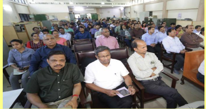
Audience on the day