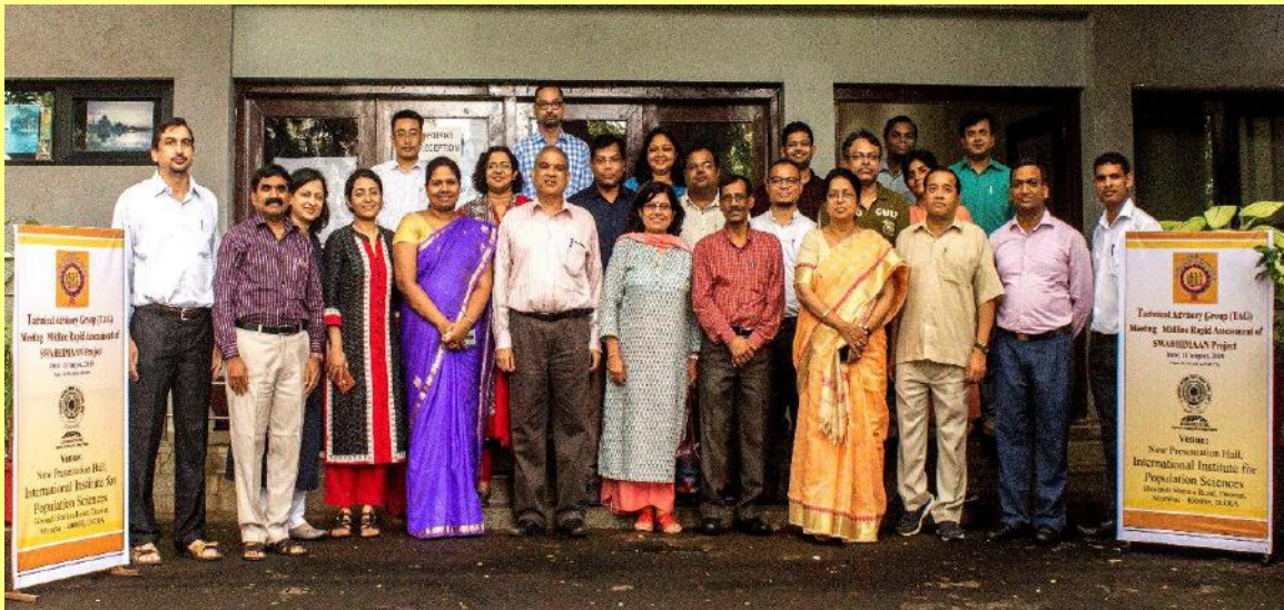
Swabhimaan PI, Co-PI with Officiating Director (IIPS), Unicef, external expert including faculty of IIPS with Research staff