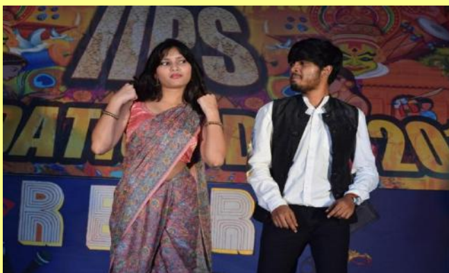
Students performing dance at the Foundation Day Programme