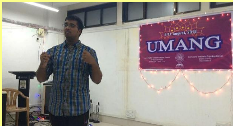
Student participating in Mono-Act held during the Umang

The Annual Foundation day is one of the most awaited events of IIPS. This year, Foundation Day was celebrated with the theme "Retro" held on 14 th August, 2018. Performances were commendable based on the current year's Retro theme. The backdrop and decoration were very much appreciated by all because of the hard work of the creative and the in-house team of IIPS.