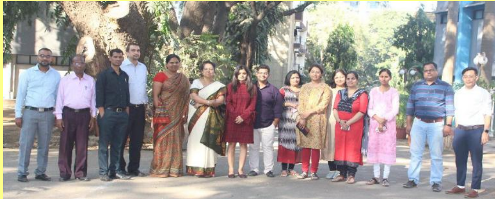
Swabhimaan PI, Co-PIs with UNICEF experts and Research staff