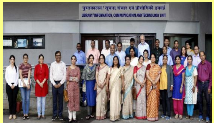
Organizers and participants of the workshop