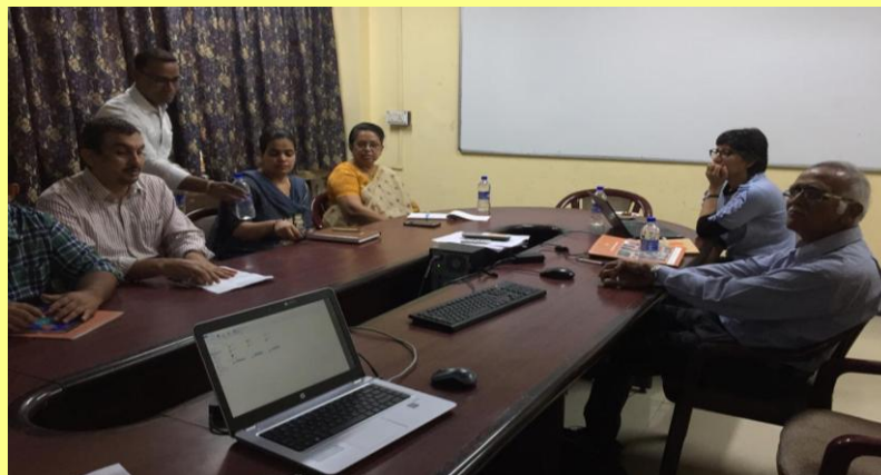
Meeting of Swabhimaan PI and Co-PIs with UNICEF and other external experts