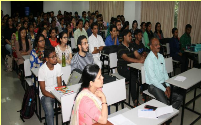
Participants of the orientation programme