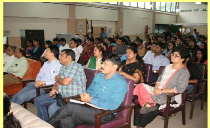
Audience on World Population Day