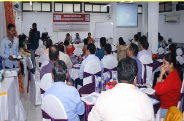
Training session during the Workshop

On October 8, 2018, the University of Sydney (USYD) and International Institute for Population Sciences (IIPS) jointly organized a workshop on triple burden of malnutrition in India - coexistence of undernutrition, overweight/obesity and micronutrient deficiency in the same population, community, household, or individuals. The workshop aimed to bring together experts from various disciplines - economics, nutrition, health; as well representatives from NGOs and the Ministry of Health and Family Welfare to assess what has been done and brainstorm what can be done to address the concerns with multiple burdens of malnutrition in the country. A key conclusion of the day-long discussion was that multiple burdens of malnutrition is indeed an emerging problem in our country, a particular area of concern being the rising overweights among rural residents. Interestingly, exploratory analysis reveals that dual burden of nutrition in India is dominant in middle-to-upper income households. Interdisciplinary and intersectoral efforts are crucial in tackling the problem. Complexity of the issue also calls for increasing synergy between academia and policymakers to better understand the various causal forces and accordingly design effective interventions. The workshop was funded by the India Development Fund of the Office of Global Engagement, USYD.