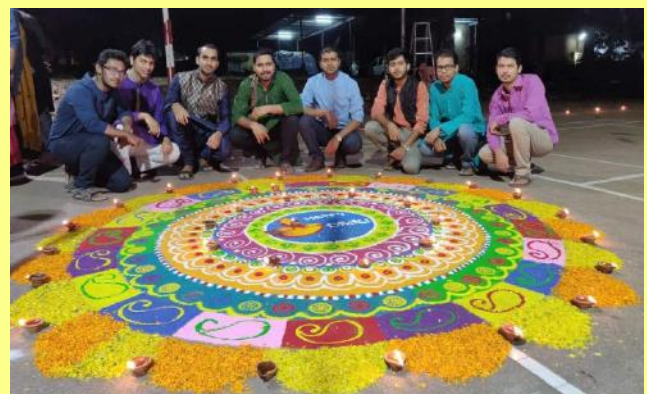
Diwali celebrations at IIPS