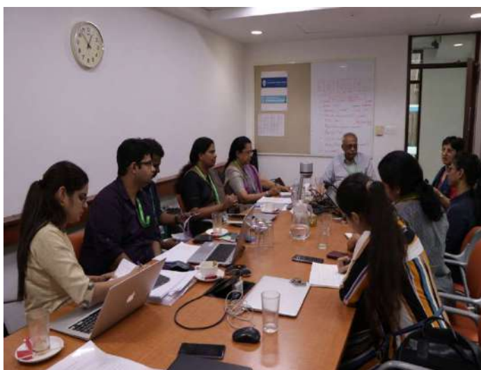
TAG meeting in Delhi on 30 th August, 2019