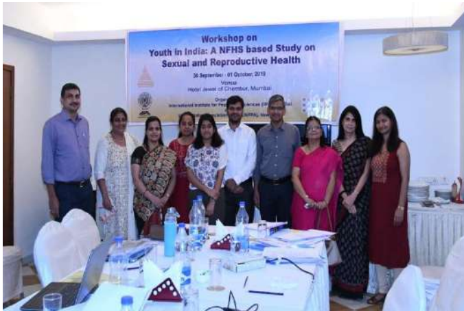
Workshop on Sexual and Reproductive Aspects of Youth in India: An NFHS Based Study