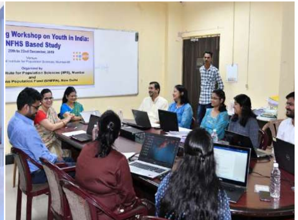
Youth in India: An NFHS Based Study- Report Writing Workshop