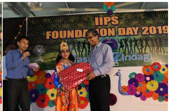
Prize Distribution to the Children