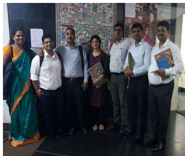
Bihar Dissemination Meeting on 13th November, 2019