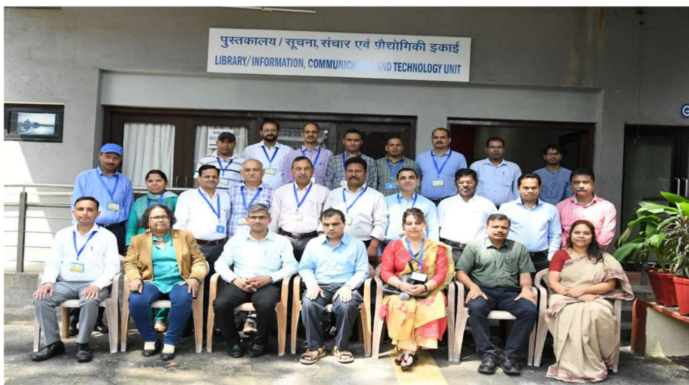
Group Photo with All the Participants, Director and Coordinators of Short Term Training Program

Demography Statistics” from 23rd to 28th of September, 2019 (Six days). A total of fifteen (15) officials from various districts of the Himachal Pradesh attended the training programme. The program was customized such that the participants had more time to apply concepts and measures on primary data, preferably for the state and districts of Himachal Pradesh using data from 2011 census and other sources including CRS, large scale sample surveys. In general, theory classes were conducted in the first half of the day and the second half was spent for hands on exercise where participants could apply demographic techniques and measures manually on excel sheet as well as with the help of various available demographic software. The programme was organized by Prof. Usha Ram and Prof. Archana K Roy, Coordinator, Short Term Training Program at the Institute. Mr. Babu Santosh Kumar, Dr. P Murugesan, Mr. Nasim Ahmed Mondal, The STTP and Publication Cell team members facilitated the hands on exercise sessions to assist trainees who were less comfortable working on computers.