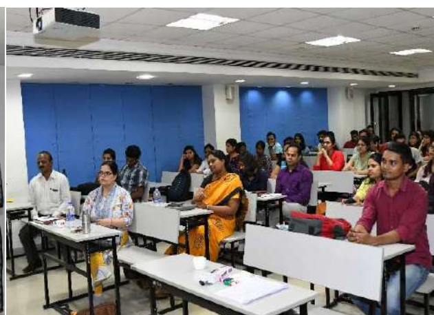
Participants of Orientation Programme