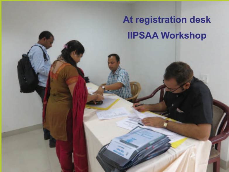
Workshop on Maternal Child-Health and Development 3rd May, 2013