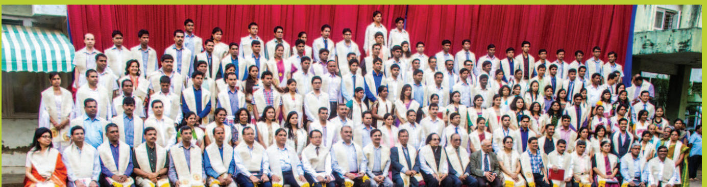
IIPS Convocation 2013