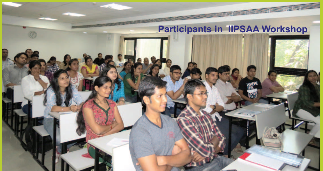
Participants in IIPSAA Workshop