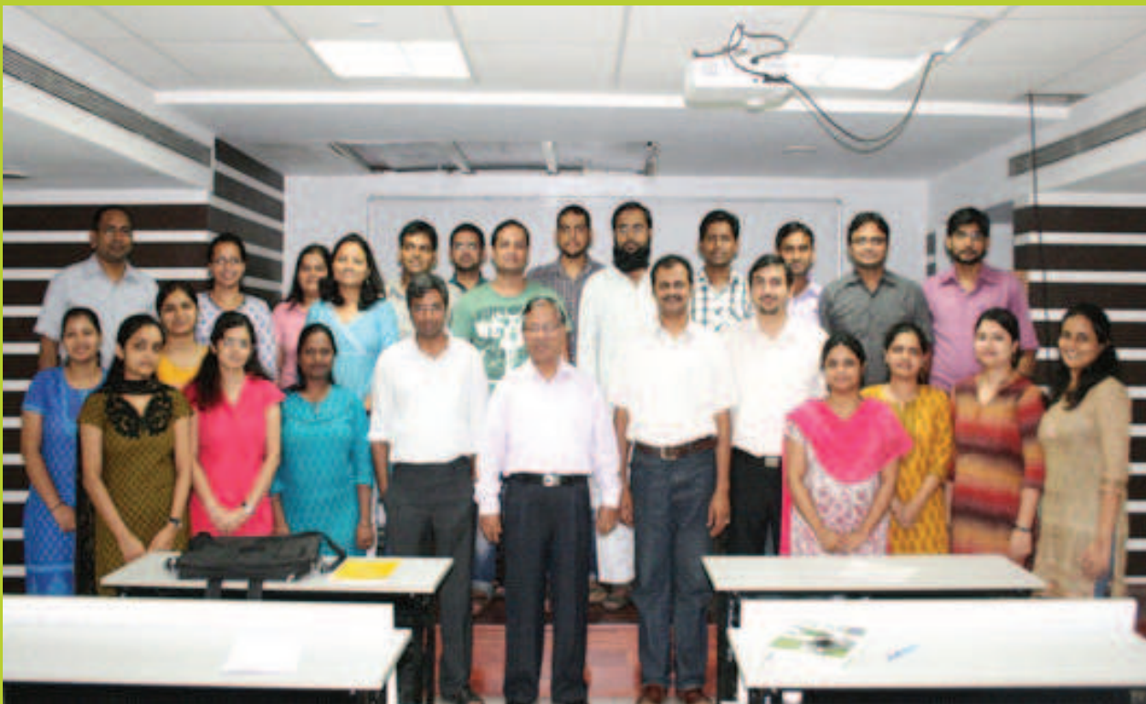
Workshop in Population Dynamics (LSWPD)-II (July 15 – 19, 2013)