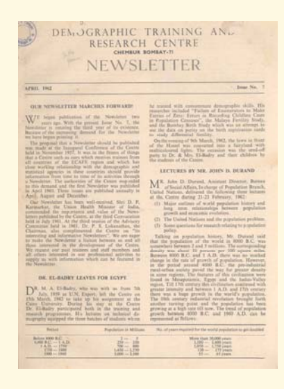
Fig. 2 Cover page, 1961

Fig.1. Cover page, 1960 (First Newsletter of IIPS)