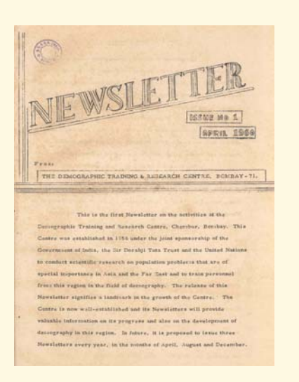
Fig.1. Cover page, 1960 (First Newsletter of IIPS)