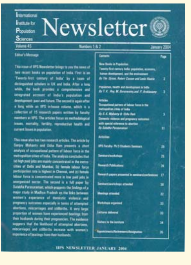
Fig.4 Cover page, 2004