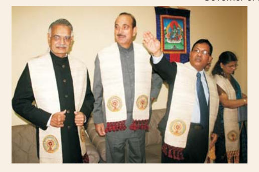
Introducing IIPS faculty to the Chief guests