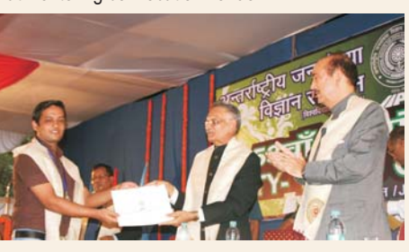
A student receiving degree