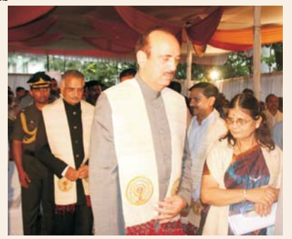
Shri Gulam Nabi Azad and Shri Shivraj V. Patil entering convocation venue