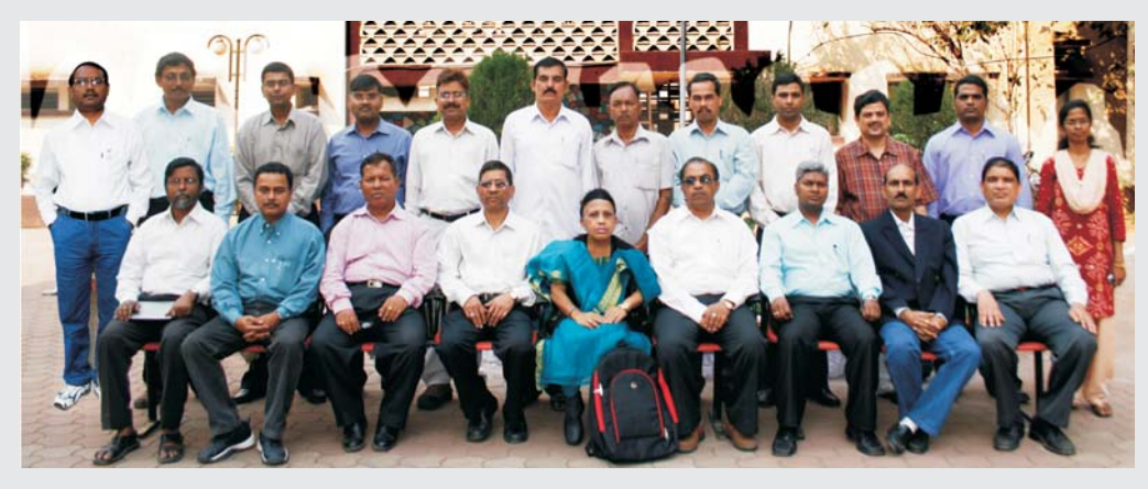
Participants of the training programme 'Refresher Course in Demography'