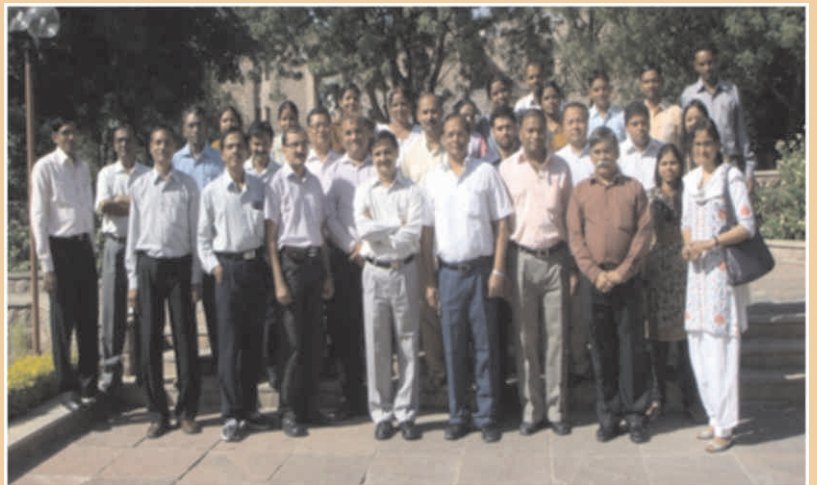
MoHFW, IIPS and NIHFWS officials with field investigators at Jaipur during pre-test.