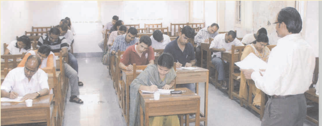
शुद्धलेखन प्रतियोगिता में भाग लेते हुए कर्मचारीगण एवं छात्र।