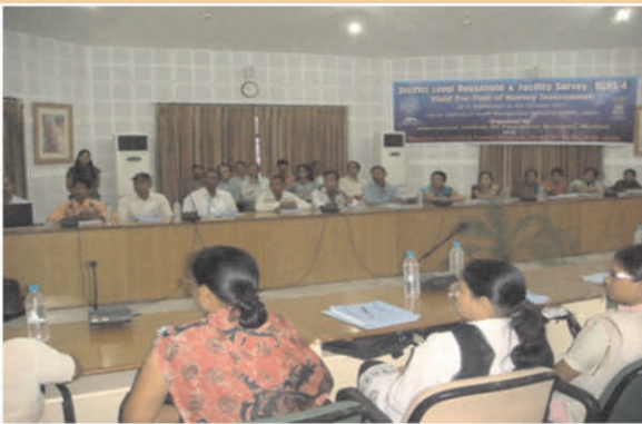
Training session in progress at Jaipur for pre-test

International Institute for Population Sciences has been designated as the national nodal agency to conduct the District Level Household and Facility Survey (DLHS-4) by the Ministry of Health and Family Welfare, Government of India. DLHS-4, in addition to household and facility survey, has two new components- information on Causes of Death and Clinical, Anthropometric and Biometric (CAB) aspects. The household and facility survey would be implemented in 26 states and union territories. The facility survey will be undertaken in nine states of Uttar Pradesh, Uttarakhand, Madhya Pradesh, Chhattisgarh, Bihar, Jharkhand, Odisha, Rajasthan and Assam where the household survey is covered under the Annual Health Survey (AHS).