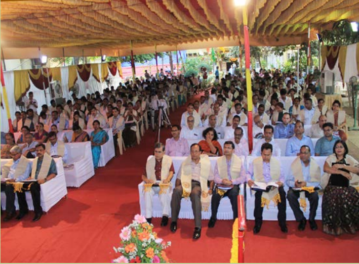
Audience of 57th Convocation