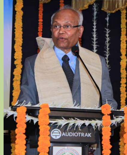
Dr. R. A. Mashelkar delivering Convocation Address