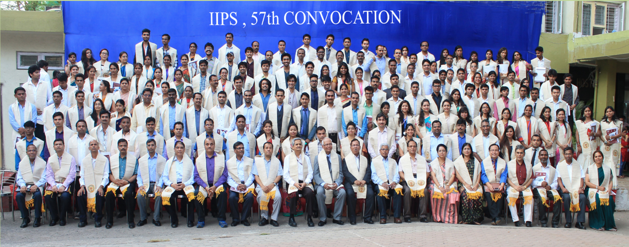
Group photo of Faculty and Students Receiving Diploma/Degree at the Convocation with the Chief Guest