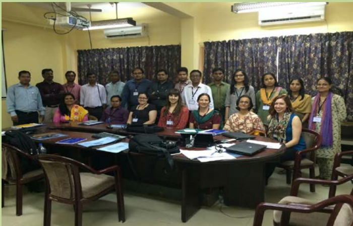
Participants of First TOT