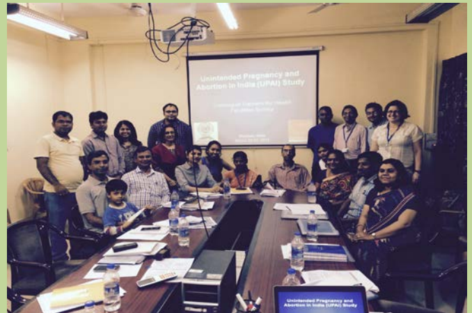
Participants of Second TOT

2 nd TOT of the project: The second TOT for the project was held during 23-30 March 2015 at IIPS. In this training program FA's from Uttar Pradesh; Madhya Pradesh and Tamil Nadu were trained for the facility survey.