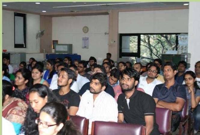
Audience during Memorial Lecture