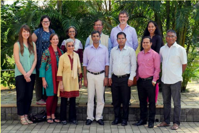
Participants of UPAI Data Analysis Workshop, Lonavala