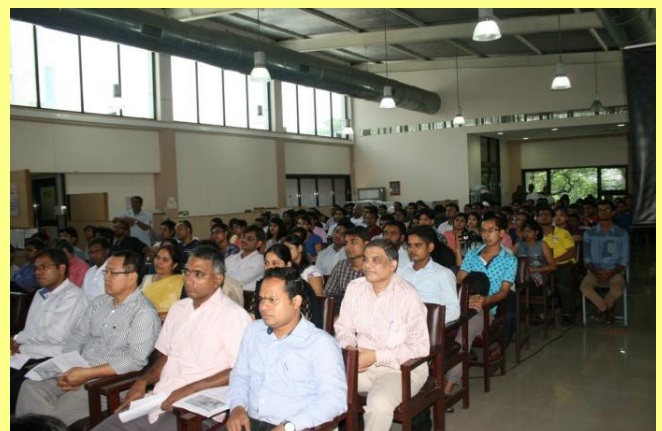
Audience on World Population Day