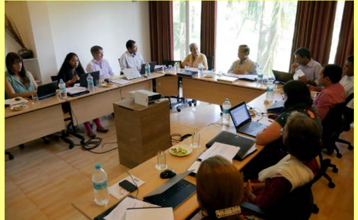
UPAI Workshop in progress, Lonavala