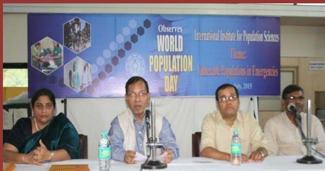
Director IIPS and Invited Speakers on World Population Day