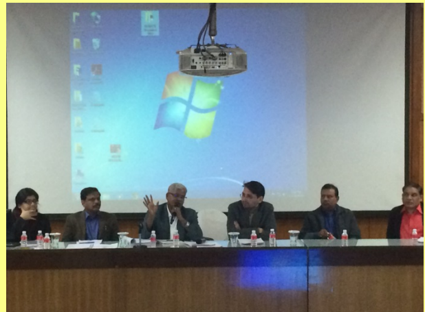
LASI Steering Committee Meeting (SCM)

The First Steering Committee (SCM) meeting of LASI was held on Friday, 7th August 2015 at Nirman Bhavan, Ministry of Health and Family Welfare, Government of India to discuss the progress of activities, budget requirements and funds release. As per this meeting, it was suggested to prepare a roadmap for survey launch with month wise budgetary requirement from each of the four sponsors and work plan for each quarter and it should be presented to the MoH in next scheduled meeting. Issues related to timeline and procedure for translation of survey instrument in state languages, bidding process and evaluation procedure to selected field agencies (FA) were also discussed.