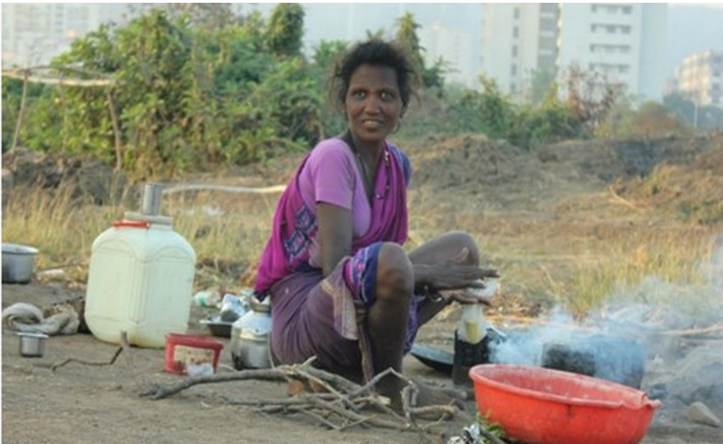
A seasonal migrant preparing food at her workplace.

“The mukhadam comes to the village and informs us about employment opportunities. He sets the wages and pays an advance. A work unit (koita) is paid Rs. 25,000/- in advance for working for six months. This advance helps to keep us alive when we are jobless in villages” — A respondent of the study.