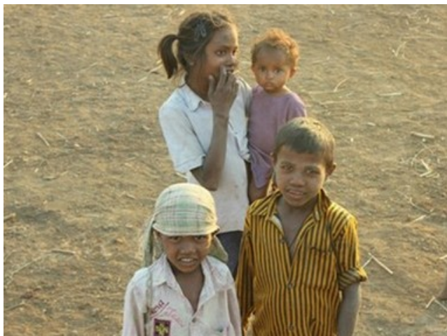
Children of seasonal migrants at a brick kiln in Ahmednagar, Maharashtra.

This distress, in combination with a lack of alternative livelihood opportunities, has deepened the plight of the rural populace and given rise to seasonal migration as a survival strategy. This is particularly true for rural people in remote areas, the chronically poor, landless, and those with low educational attainment. A report on the state of Indian farmers, released in 2018 stated that 76 percent of farmers preferred to do work other than farming and 61 percent of these farmers preferred to be employed in cities because of better education, health, and employment prospects there.