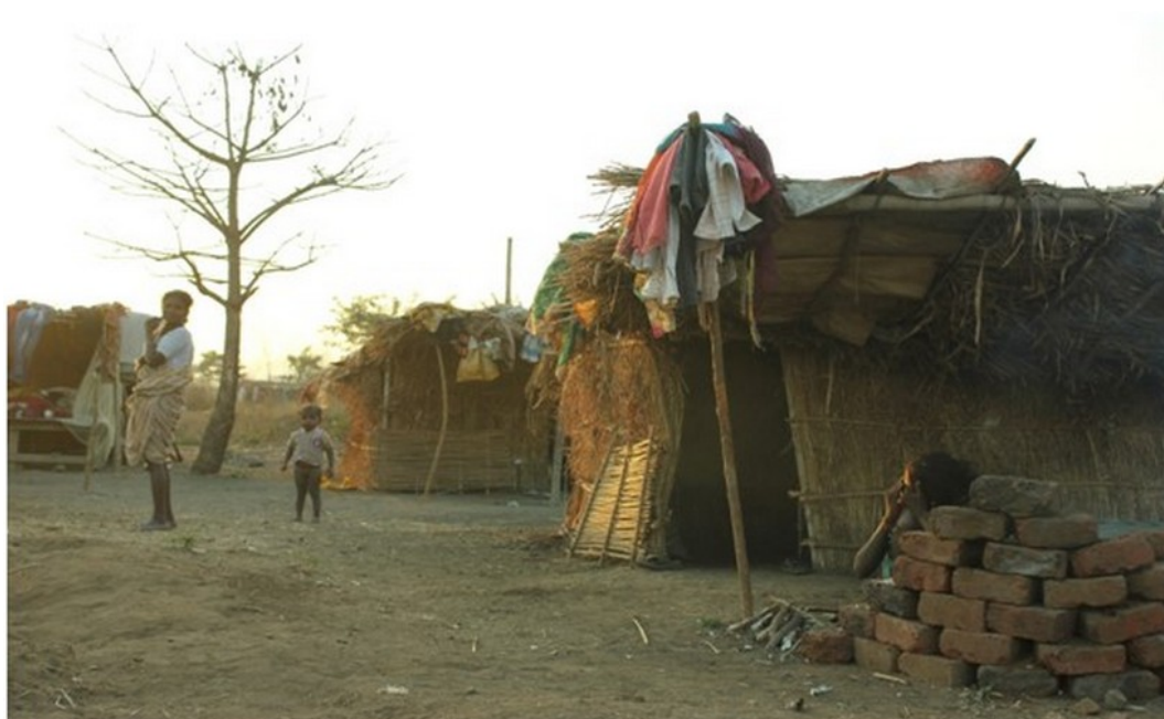
An image showcasing the living arrangements of seasonal migrants at a brick kiln in Raigarh district.

Seasonal migration is an invaluable source of labour in rural agro-based industries as well as in the urban informal service sector, but their often distress-related origins are symptomatic of a large-scale policy failure. The reasons reported for leaving the villages by the majority of households in the study revolved around lack of opportunities. Their economic circumstances, along with lack of livelihood opportunities, left them with no choice but to migrate. However, even after migrating, they remain trapped in a vicious cycle of debt, contributing to further distress seasonal migration.