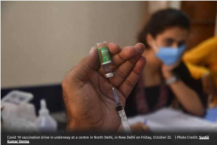
Covid 19 vaccination drive in underway at a centre in North Delhi, in New Delhi on Friday, October 22.

SHARE ARTICLE | | | | | | PRINT | A | A | A